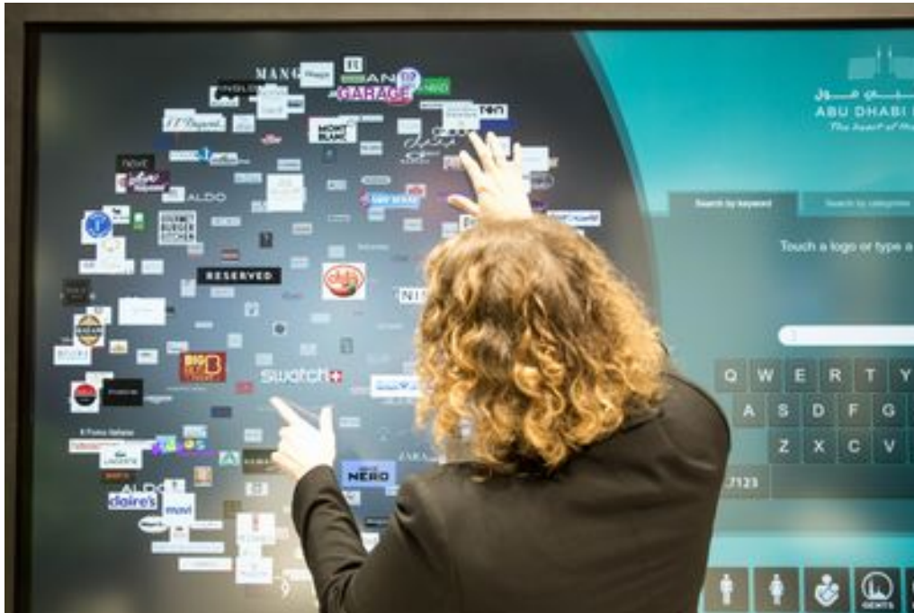
Intuitive logo cloud from Kompas wayfinding