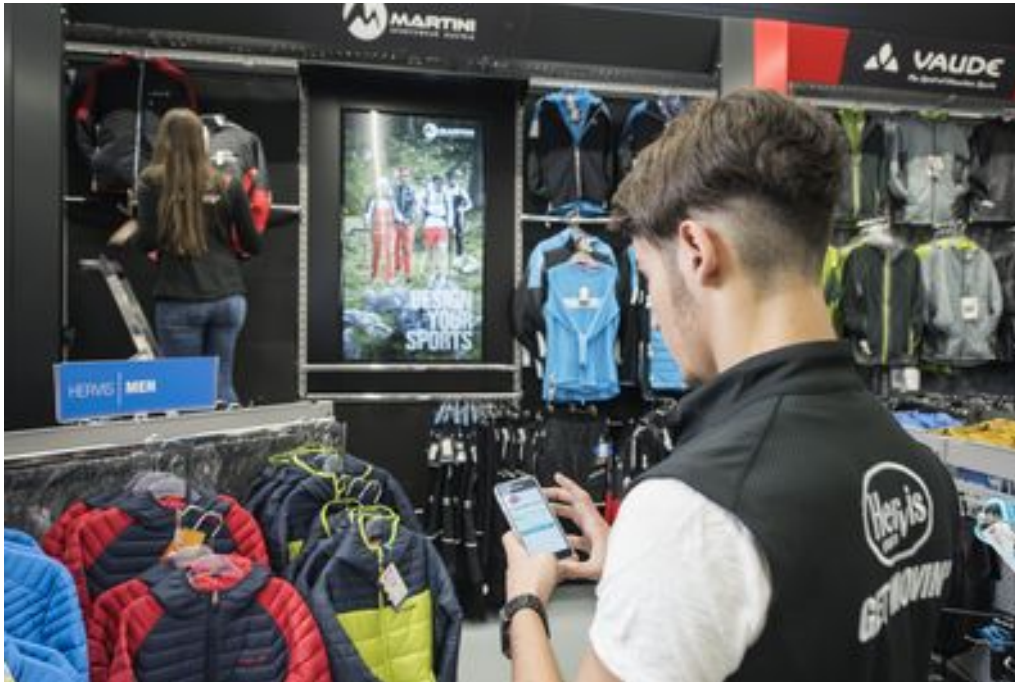
With smart.select, kompas offers an ideal feature for the POS. Change content quickly and simply via smartphone.